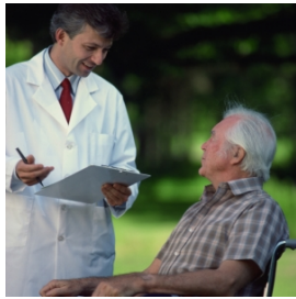
Long-term care is not just provided in nursing homes--in fact, the most common type of long-term care is home-based care.